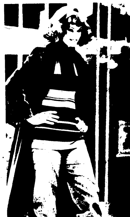
This striped pullover is casual but becoming.