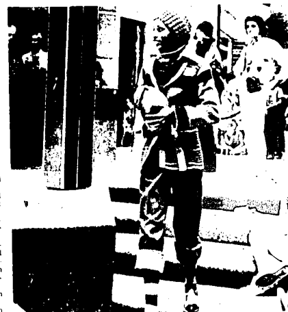
A woolly cap and sweater make football games warmer.

Women will need a little more though to pull these separates together into a really terrific look, something like a pair of boots, oval neck sweater or turtleneck. But by taking individual pieces and mixing them together, you're bound to come up with something truly unique.