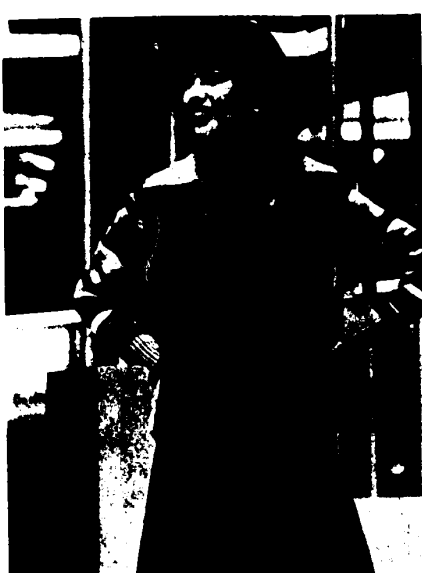
A tunic and sweater are perfect for the office.