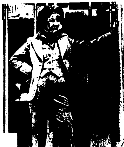
Vested pantsuits are pretty and practical for the woman on the go.