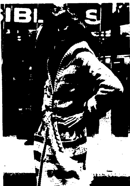
Enjoy nippy autumn afternoons in a cozy sweater-coat.