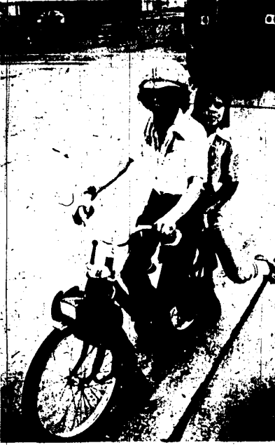
The motorized bicycle recently has become popular among all age groups, but its presence on the road has added another spark in the continuous battle of sharing the road.

Fancy cars, little bikes and big cars—they all must learn to share the road before the battle can end.