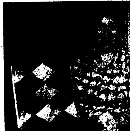
Both copper foil and lead coming techniques are taught by Beverly Halbesauer in her stained glass classes to fashion plants, terrariums, candleholders and lamps.