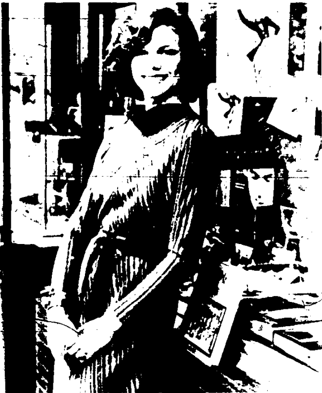
Polyester combines with acrylic and rabbit hair for a striped Leslie Fay dress with an easy skirt. In green or grey, has solid stand up collar and belt.