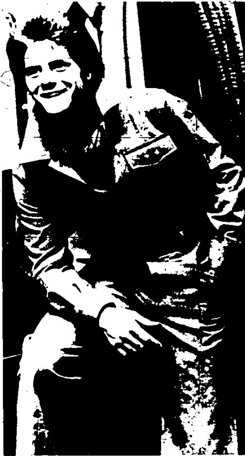
This lightweight wool jump suit is a versatile closet mate.