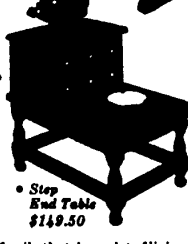
• Step End Table $149.50