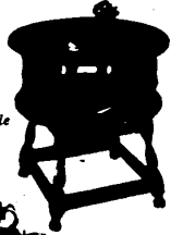
• Revolving Drum Table $134.50