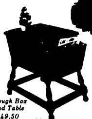
• Dough Box End Table $149.50