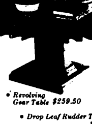
• Revolving Gear Table $259.50