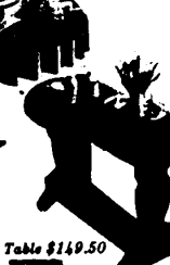
• Drop Leaf Rudder Table $149.50