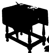
• Butterfly Drop Leaf Table $149.50

Ethan Allen calls it "Old Tavern" ... but it's a style as tuned-in today as it was 200 years ago!