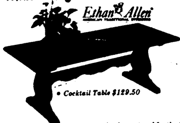
• Cocktail Table $129.50