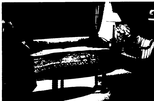
Sold by American of Martinsville $480.