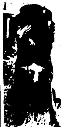
Laddie come home

DRC SCHOOLCRAFT & MIDDLEBELT RES/INFO 421-7170