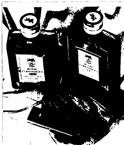
A ROYAL COPENHAGEN MAN NEVER HAS TO USE MATCHES TO LIGHT HIS CIGARETTE. OR HERE.

Merck Center is located at 2500 Eleven Mile just east of Middle Belt.