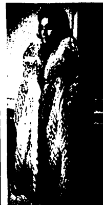
Natural badger was also shown.