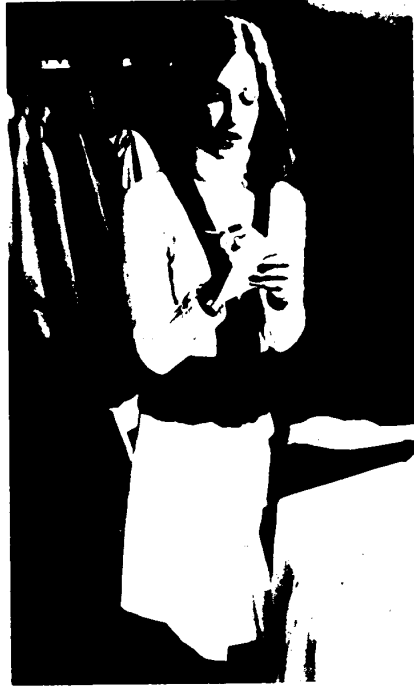
What every working woman needs an outfit that looks good day and night.