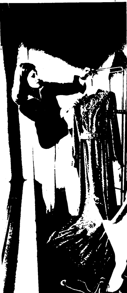
This pant ensemble maintains its good looks even when working.

More Charlotte Ford clothes should be coming in the spring, including evening outfits. Which means women will have more solid good looks to look forward to.