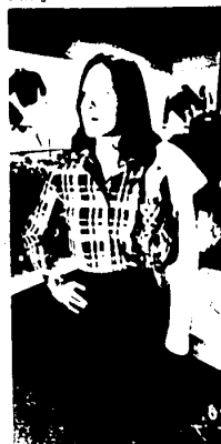
Perfect for casual events, a three-piece slack ensemble.