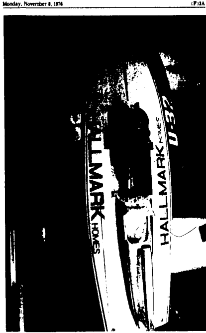
Although this may look like the real hydroplane seen on the Detroit River, in reality it's a miniature model, radio controlled with an air-cooled engine.

construct and costs more than $50.