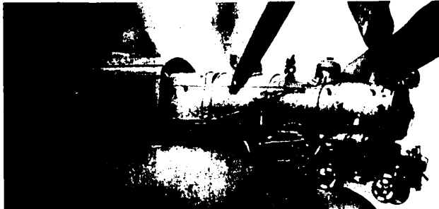
The best gifts come in small packages as is exemplified by this HO scale all-brass engine.

Stop in for a taste of the Christmas Spirit