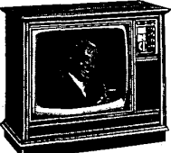
Contemporary model 6922