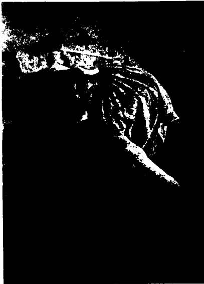
Yoga instructor, Karen Farkus, assumes one of 12 term-up postures.