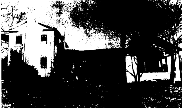
Several small fires ripped through the breezeway-annexed family room of a house on Farmington Road near Thirteen Mile. Farmington Hills police are investigating the possibility of arson.