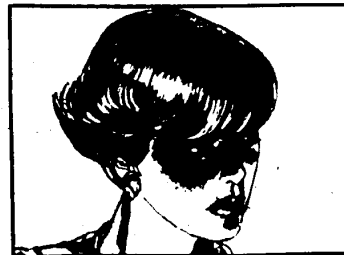
2701 Somerset Mall, Troy