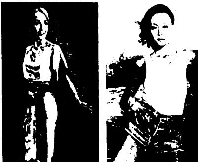
The two-piece hand-painted silk faille-a scarf top and wrap skirt sells for $135. Actress Irene Tsu poses on movie location of "Paper Tiger." She fell in love with the batik process while filming the movie.