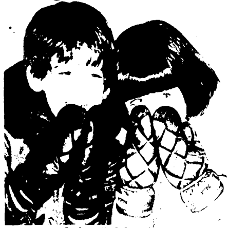
Troy, Somerset Mall, Big Beaver at Coolidge