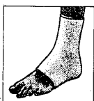
Thermolastic Ankle Comforter