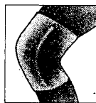
Thermolastic Knee Comforter

Gentle compression, to provide mild support.