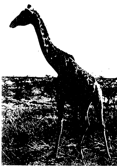
This friendly critter will be one of those to greet travelers taking advantage of the tour being offered by the Farmington YMCA.