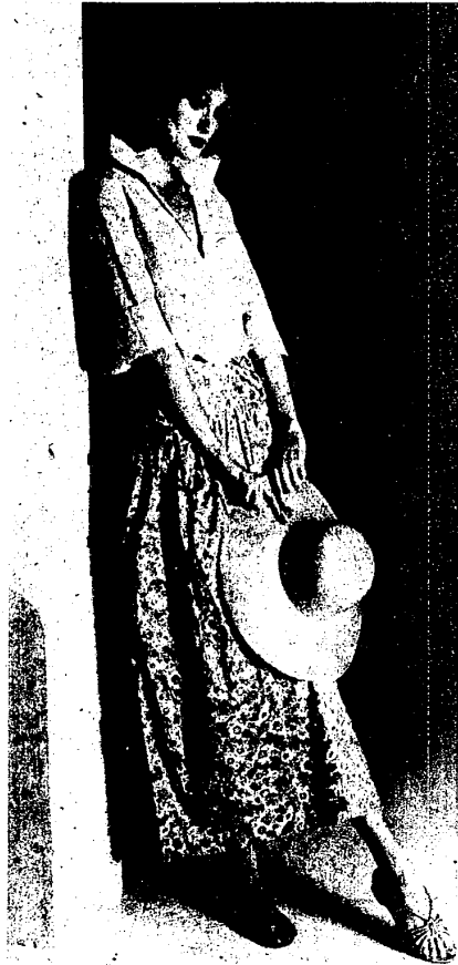
A dropped yoke, floral print skirt with gently flowing tucks at the hips is paired with Cacharel's pullover sailor shirt in the softest of handkerchief cotton for a comfortable summer-time look.

There may be some happy fashion buffs around South Oakland County on this Valentine's Day whose special surprises from their sweethearts included clothing designed by Jean Cacharel.