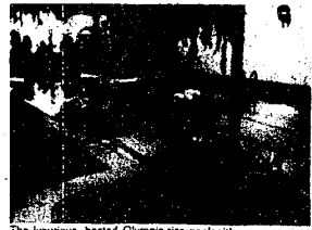
The luxurious, heated Olympic-size pool with its garden decor.