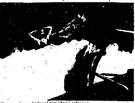
Ultra-modern whirlpool provides a relaxing sensation unlike any other.

Vic Tanny Bloomfield Executive Health and Racquet Club