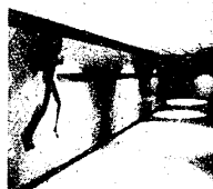
The 1/8 mile indoor jogging track.