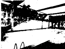
The Olympic-size swimming pool complete with a large co-ed whirlpool and natural surroundings.