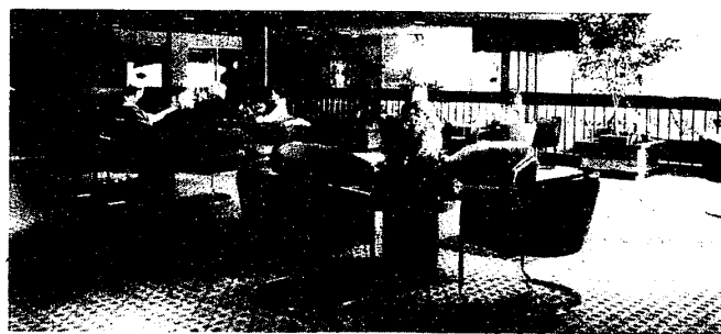
The elegant 2nd level lounge area. A nice way to relax with friends over a chilled health juice.

Simply put, our Vic Tanny Bloomfield Executive Health & Racquet Club is beautiful. As a matter of fact, if you didn't see our unique sign in front, you wouldn't know it's a great place to work out. But, make no mistake...it is! From the moment you arrive, you're surrounded in an atmosphere of luxury. Outside - the Bloomfield Executive Health & Racquet Club is set in a thickly-wooded natural environment. Inside - you'll delight in the rich, plush carpeting...the elegant appointments throughout the Club, and the finest, most complete work out facilities you'll ever see. And it's all awaiting your approval. Come join us, you'll love the beautiful new world of physical fitness.