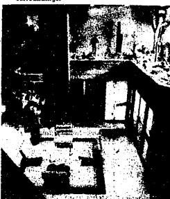
The Club lobby as seen from the 2nd level lounge area with its unique plant and tree garden.

The New Vic Tanny Bloomfield Executive Health & Racquet Club.