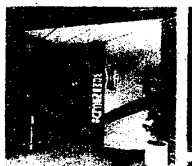
Women's Club entrance. Inside there's a whole new world of health and beauty.