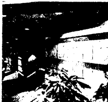
Entrance to the Men's Club workout area and adjacent facilities.