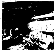
Entrance to the Men's Club workout area and adjacent facilities.