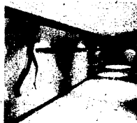
The 1/8 mile banked indoor jogging track.