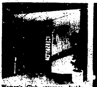
Women's Club entrance. Inside there's a whole new world of health and beauty.