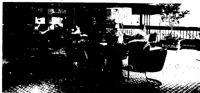
The elegant 2nd level lounge area. A nice way to relax with friends over a chilled health juice.

Simply put, our Vic Tanny Bloomfield Executive Health & Racquet Club is beautiful. As a matter of fact, if you didn't see our unique sign in front, you wouldn't know it's a great place to work out. But, make no mistake...it is! From the moment you arrive, you're surrounded in an atmosphere of luxury. Outside - the Bloomfield Executive Health & Racquet Club is set in a thickly wooded natural environment. Inside - you'll delight in the rich, plush carpeting...the elegant appointments throughout the Club, and the finest, most complete work out facilities you'll ever see. And it's all awaiting your approval. Come join us, you'll love the beautiful new world of physical fitness.