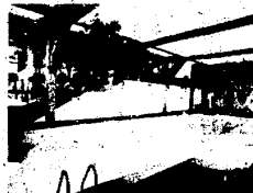
The Olympic-size swimming pool complete with a large co-ed whirlpool and natural surroundings.