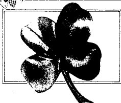
Enjoy the Luck of the Irish 4 1/2-INCH, 24-KT. GOLD-PLATED Wall Plaque or Paperweight

One glance will remind her of your best wishes all day. Inscribed on back with inspiring message!