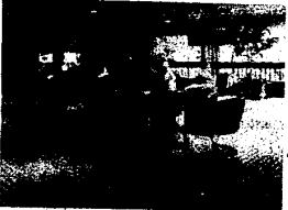
Relax in our richly appointed lounge.