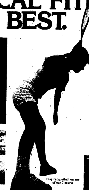
Play racquetball on any of our 7 courts