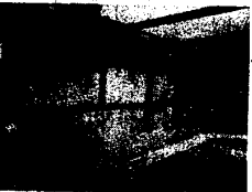
Swim in our olympic-sized pool.