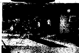
Thickly carpeted exercise areas.