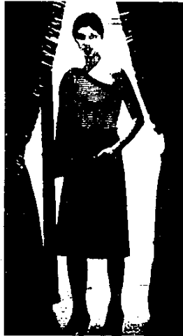
Bill Blass's one-shoulder T-shirt teams with a matching cardigan and a black cotton slit-front skirt from France.

He made a fashion statement, and it's one we'll all be wearing. Not the costume gypsy or rich peasant, but softer, fuller skirts, easy blousy tops and scoopy peasant necklines. The influence is to be seen everywhere.