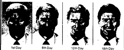
Time-lapse photographs show how gradual action of Grecian Formula 16 lets you control just how much gray you slowly get rid of—some of it or all of it.

WHITING PLAINS, N.Y.—Millions of men all over the country are now using a remarkable product to control just how much gray they slowly get rid of. It is called Grecian Formula 16 and the results are simply amazing. Grecian Formula 16 is a practically clear liquid, as easy to use as hair tone. This remarkable formula works for any color hair because it combines with the natural chemistry of the hair to recreate natural-looking color. There is no mess and no rub-off. You simply use it every day for two or three weeks until you slowly get rid of just as