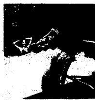
ENJOY our co-ed whirlpool.