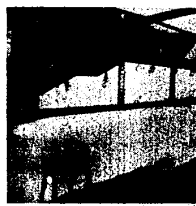
ENJOY our heated Olympic-size pool.

If these aren't your numbers, call ours and we'll help you get ready for the warm and wonderful summer. And, besides looking great, you'll enjoy 'acquiring' your new shape because simply put, our Bloomfield Executive Health & Racquet Club is beautiful. You'll enjoy swimming, jogging, racquetball, steam and saunas, whirlpool, and much more! And all of this enjoyment and beauty awaits you at the Bloomfield Executive Health & Racquet Club, so come join us.