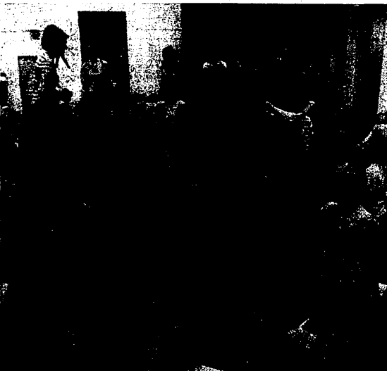
Gary Giguere, 2, (top) fights a current to fish Piglet out of a raging river in the Farmington Library; Meanwhile (bottom) moms and tots enjoy a candy walk.