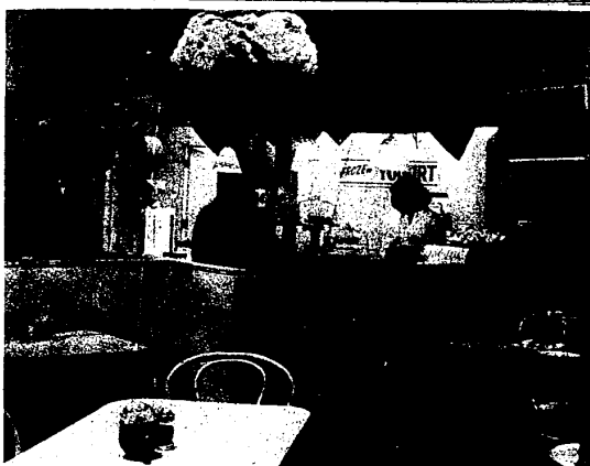
Butcherblock tables and bentwood chairs harmonize in the contemporary setting of Just Desserts cafe.

The menu lists European-style pastries, for a rich dessert choice of pecan pie, chocolate cheesecake, Viennese pastry, or apple Bavarian ($1.25 a slice). Sherbert-textured, fruit-flavored, pure yogurt is scooped out by the dish or sundae.