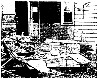
THE TARGET -- The culprits collected last May and again the targets for October's cleanup drive are the large appliances, worn out furniture, old tires, scrap wood and other large debris.