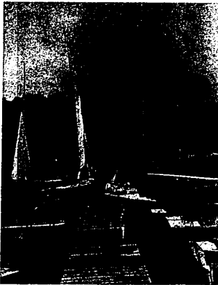
IS THE WIND RIGHT? -- The crew of a "rebel" checks the wind direction against the position of the sails.