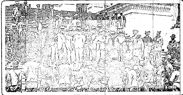
Vice President Marshall, addressing the boy scout "living circles" on the steps of the capitol, declared he hoped they will reach a membership of a million to aid in combating Bolshevism. The vice president is at the left center of the picture with his hand on his hip. Several members of the senate and house helped him receive the boys.