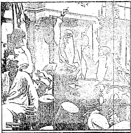
Exclusive photograph showing native Cairo women addressing a crowd in one of the principal streets of the Egyptian city. The speakers are urging greater patriotism and loyalty to their land. This is the first time that Egyptian women have been permitted freedom of speech in public.