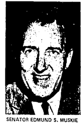
SENATOR EDMUND S. MUSKIE

The realization of the religious and cultural ideals of our forefathers. The Maine senator's father was born in Poland and immigrated to the United States in 1903. His mother is a native of Buffalo, N.Y. He was the first elected Democratic senator from Maine in 1958 and previously has served as the first elected Democratic governor of that state for two consecutive terms beginning in 1954. Muskie is a cum laude graduate of the Cornell University Law School, married and the father of five children.