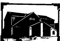
8 STREAMWOOD ESTATES from $48,500 1969 Pontiacville Ct., ROCHESTER North of M-59, East of Crooks Rd. Van Allen Builders 642-5353 & 652-4546