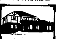
10 LONG LAKE ESTATES $123,990 3962 Winterset, W. BLOOMFIELD 1/2 mi. W. of Middlebelt, S. of Long Lake Rd. Demos Sales Co. 855-1511