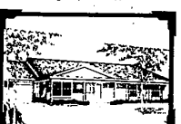
5 CROSS KEYS priced in $40,000's 2975 Roundtree, TROY South side of 16 Mi. Rd. E. of John R Rd. Single family condominium Kaufman & Broad Homes, Inc. 689-7510