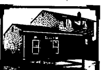
4 EASTHAMPTON PLACE $52,490 23022 Byers Dr. STERLING HTS. N side of 17 Mi. Rd. bet. Mount & Ryan Rd. Barber-Fernberg Corp. 979-0930