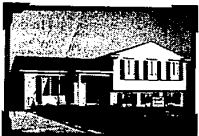
2 CHARRINGTON PLACE $48,990 13453 Wessex Ct. STERLING HTS. Schoenherr Rd. 1/2 mi. S. of 19 Mi. Rd. Barber-Fernberg Corp. 979-0930 & 739-5248