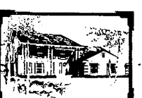
12 TANTALLON priced in $70,000's 34540 Bunker Hill Dr. FARMINGTON HILLS 12 Mile between Drake and Farmington Road Kaufman & Broad Homes Inc. 553-9330