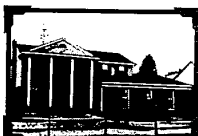
7 GROSSE PINES $113,000 13453 Wessex Ct., ROCHESTER Walton Blvd. bet. Livernois and Adams Rd. Gilbert & Vennetelli 652-7112 & 652-6161