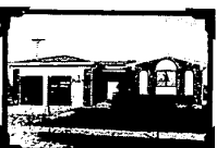
3 BEAVER CREEK $58,990 1019 Rose May Dr. STERLING HTS. S of 16 Mi. Rd. E. of Ryan Miracle Homes Inc. 628-0210 & 977-2460