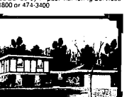
15 TRAILWOOD $80,400 1857 Tenneyson Dr. PLYMOUTH TWP. N of Ann Arbor Rd. W of Sheldon Rd. Biltmore Homes Co. Curtis Building Co. Dean Cultum Inc. 459-2830