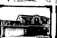
17 PARKWOOD ESTATES $55,490 22462 Sault Rd. CANTON TWP. West Side of Lilley Rd. S. of Ford Rd. Huntley Homes, Inc. 559-8880 & 981-2040