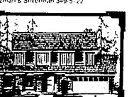
14 WHISPERWOOD priced in $80,000's Brashear Rd. S of 16 Mile NORTHVILLE across from Northville Commons Maruz Builders / Impact Marketing Services 658-1800 or 475-3300