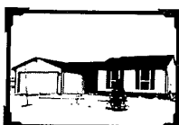
6 AVON HILLS VILLAGE $58,990 1724 Danbury Lane, ROCHESTER East of Livernois, 1/2 mi. S. of Avon Rd. Unip Housing Assoc. 652-6777