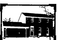
11 HIGHGATE ON THE LAKE $82,950 1549 Chownings Glen, WIXOM 1/8 to 1/2 mi. Rd. to Kettle Rd. Rt. to Benetton left to Loon Lake Rd. Douglas Homes Inc. 851-1710