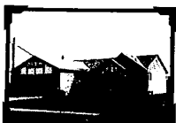
1 HAVERHILL $58,990 47020 Barbara Rd. MACOMB TWP. N on Hayes from M-59. E on 21 Mi. Rd. to Barbara Borlan Building Co. 247-6565