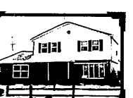
13 MEADOWBROOK $61,600 24211 Kings Pointe Dr. NOW 10 mi. between Novi Rd. & Meadowbrook Rd. Holtzman & Silverman 349-5722