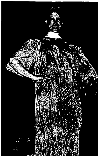
Big sleeves, scoop neck and string tie make up a modified version of the peasant dress, set off with an oblong scarf knotted and falling down the back.