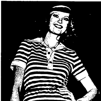
Nautical separates in black and beige are topped with a black straw hat with beige ribbon.