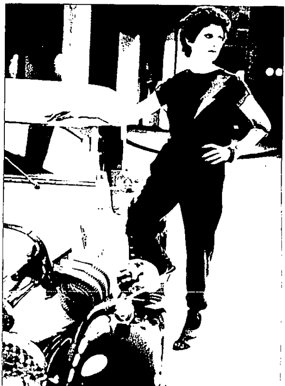
Disco dancing drama by Marina Ferrari comes in black silk crepe de chine. The ensemble moves over the body in an easy short-sleeved blouse with tied-at-the-ankle trousers.