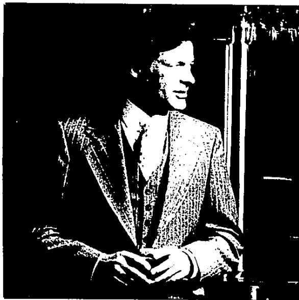
The gray-striped suit is versatile.