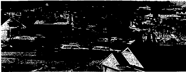
From serenity to shambles. A tornado swept through West Bloomfield in March 1976, leaving behind it a trail of debris and destruction. A new warning system reportedly will be able to alert Oakland County of a tornado more quickly and more efficiently than the patchwork system which existed in 1976.

According to published reports, National Weather Service meteorologists think television and radio warnings give people a false sense of security. According to the National Weather Service, "There is a minimum delay of five minutes between the time of an official report and wide dissemination. More likely, it would take 10 minutes to get the word to commercial stations."