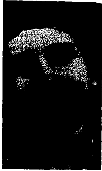
MOTRIA RYZJY BIRMINGHAM GROVES