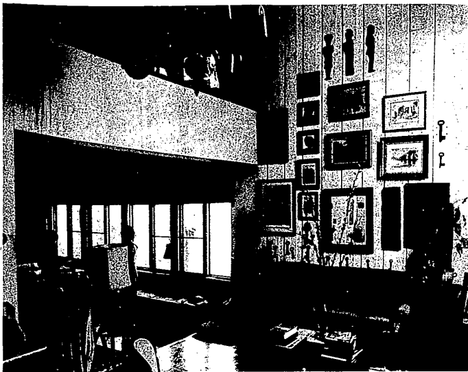
The raised living room with a vertical ceiling and balcony reflect the owners' love of the dramatic arts and verve in entertaining.