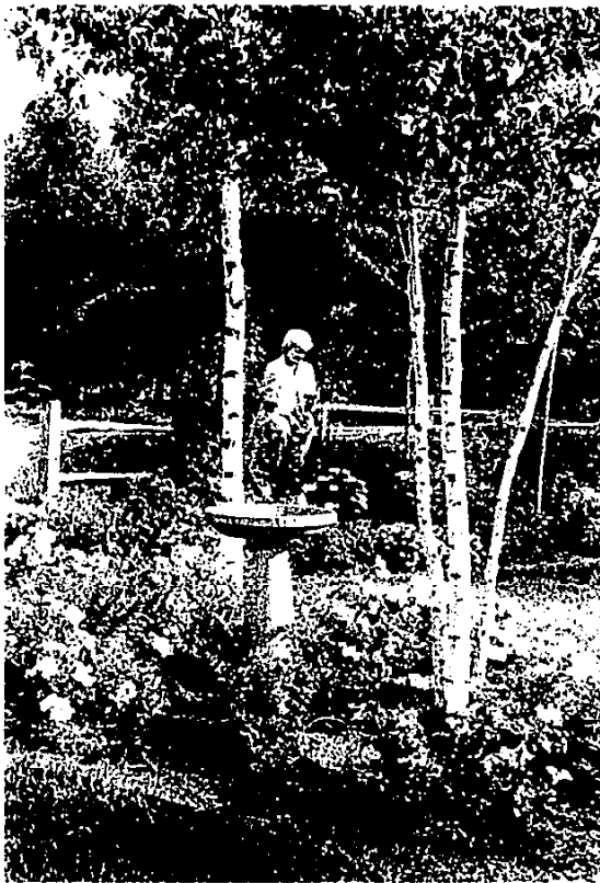
Birds as well as people enjoy this colorful garden spot that will retain its color and texture well into autumn.