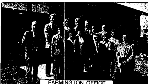
FARMINGTON OFFICE 32823 12 Mile Rd. E. of Farmington Rd. 553-8700