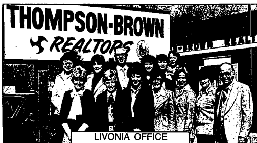
LIVONIA OFFICE 32646 Five Mile Rd. E. of Farmington 261-5080