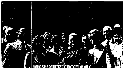
BIRMINGHAM/BLOOMFIELD 42760 Orchard Lake, W. Bloomfield 642-0703