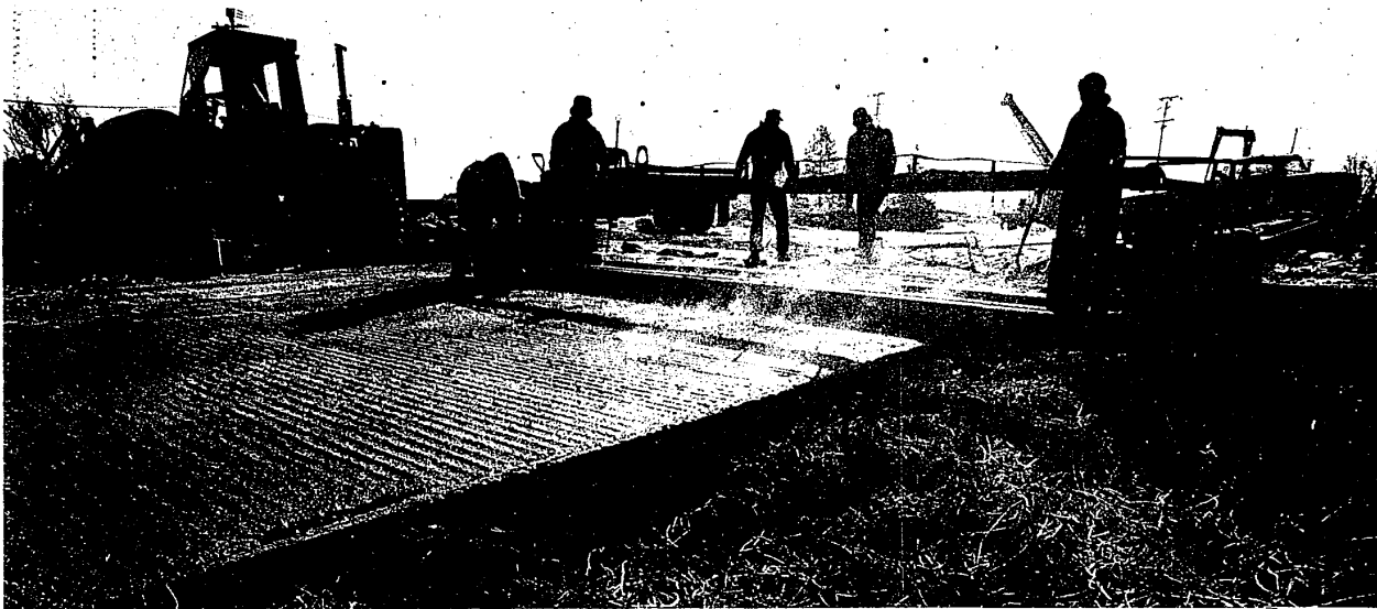
Mist rises from the early morning cement pourings in the construction of M-14.