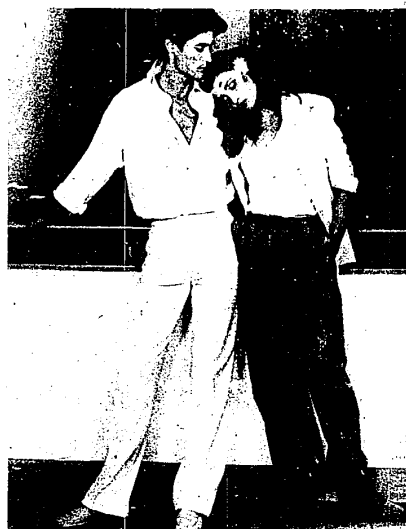
Her unconstructed blazer is worn over a silk T-shirt and khaki cotton parachute pants. His oversized shirt is worn over a cotton pull-over shirt and straight-legged pants. Collection also is at Ciabattino at 555 Woodward, Birmingham.

His next phase developed as naturally as his clothing. It was a complete collection of sportswear and outerwear that catapulted him into the fashion spotlight and created the foundation for his first Coty Menswear Award.