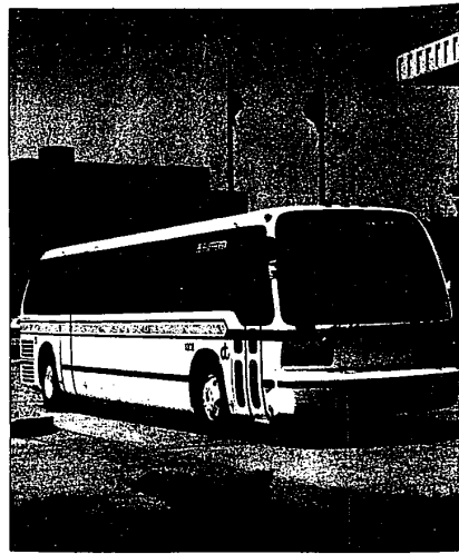
The new SEMTA and D-DOT buses are General Motors' RTS-2 model, which stands for "rapid transit series 2."

"They're the first advance design vehicles to meet the Urban Mass Transportation Administration's specifications, and the first buses in the country to utilize safety reflective stripes on the sides and backs. The pressure sensitive reflective stripes were developed by SEMTA and 3-M Co. and will provide greater night visibility for the vehicles."