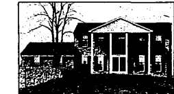
VIEW LAKE from this 1977 pillared classic in top West Bloomfield location. Library or fourth bedroom, full brick wall fireplace in family room, custom kitchen, Central Air, many comfort extras. 626-9100. $128,500.