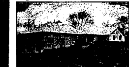
VILLA on the Riviera! Charm, quiet luxury and personality describe this North Farmington home. Entertainment center with wet bar opens to heated, in-ground pool, landscaped patio. 557-6700. $138,000.