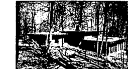
SHANGRI-LA! Three private acres with natural beauty and intriguing multi-level home. Lodge-like inside with big indoor pool, 2 fireplaces, Franklin stove, family room. Includes a barn. APPEAL! 626-9100. $133,900.