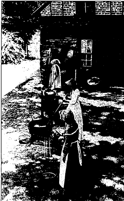
Living history demonstrations are a summer feature at the Homestead National Monument near Beatrice, Neb.

Those who feel that the Old West died with Gene Autry movies, motorized transportation and the final showdown in Dodge have never visited the still untamed, wholly western states of Montana, North Dakota, Nebraska and South Dakota. In this region, known as Old West Trail Country, homes still sit on the range, boots are everyday wearing apparel and most aspects of life still hold a Western aura. In these states, it was first the land that wouldn't be tamed. Sky-high mountains, jagged Badlands, stubborn rivers and immense plains defied civilization to take hold. Over the years, some of the land became subdued: Rivers were dammed, barbed wire enclosed roaming cattle, roads pushed through mountains. But the land refuses to be sedate—witness her mutiny in the unhampered wildlife, horizon-wide sunsets and formidable spaces. It is the heritage of the land, and the people who came and stayed out of sheer stubbornness that is the backbone of Old West Trail Country. Travelers on the highways through these