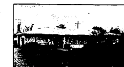
LAKE FRONT Resort on motor-boat Crescent Lake. Sharp 3 bedroom (30'x14' Master) home features 2 full baths, 30'x14' living room, 24' foyer, first floor laundry and 2 car attached garage with openers. 647-5950. $89,900.