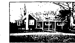
VINTAGE AND CHARACTER. Refurbished 1895 Farm House with mansion-size rooms, spiral staircase to balcony. In-ground pool, 8 stall barn, tack room. 2.4 acres in Southfield. 657-6700. $135,000.