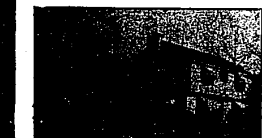
ROOM FOR COMFORT in this big 3 bedroom, 2 1/2 bath Ranch with family and Florida rooms, 2 fireplaces, rec. room, excellent kitchen, large slate foyer, extras. Private yard. Birmingham schools. 646-6000. $95,900.