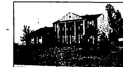
ROCHESTER Country. Six acre retreat with Builder's own 1974 Ranch. Stone fireplace in family room with wood deck over walk-out lower level. Library and four bedrooms. Barn on property. 651-651-8850. $125,900.