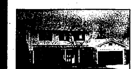
TREES AND POND viewed from upper level deck in back of this super Contemporary. Really big with 5 bedrooms plus library, walk-out fireplaced family room, 22'x15' living room. Big work shop. 646-6000. $73,500.