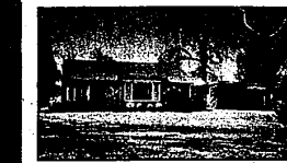
A PENINSULA with water on 3 sides of this Cass Lake resort Ranch home. Live in privacy and enjoy year-round recreational advantages. Plus a new furnace with Central Air, new kitchen appliances and new full bath in addition to a half bath. Three bedrooms, fireplace in living room, dining room and pull down stairs to full attic storage. Brick-aluminum exterior, 280' of steel breakwall. West Bloomfield. 626-9100. $114,900.

first comers, established a modicum of law and order, and left. In their stead, they left fortresses and new communities. They also left their dead: Custer on the battleground of the Little Big Horn in Montana; Lt. Levi Robinson, remembered in a Nebraska fort name; and hundreds of others. The forts are quiet now, visited by travelers who find in these stockades whispers of Indian tragedy, gold dust and dreams. Nebraska claims Ft. Robinson, Ft. Kearny, Ft. Hartsuff, Ft. Atkinson and Ft. Sidney; North Dakota, Ft. Abraham Lincoln, Ft. Abercrombie, Ft. Union and Ft. Totten; South Dakota, Ft. Sisseton, Ft. Meade; and Montana, Ft. Benton and Ft. Logan. Cowmen and homesteaders left their brand here, stronger and more indelible than even the land could desire. Cattlemen brought longhorns to a fenced and the plains with a vast line of barbed wire. Teddy Roosevelt found his Roughrider tradition in the pinnacles and lonely places of the North Dakota Badlands.