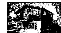
WOODED PRESERVE just behind newly listed Troy home. Four bedrooms, 2 1/2 baths plus fireplaced family room, breakfast and dining rooms, etc. Central Air, garage opener. A must see home! 688-5900. $78,900.