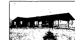
PERFECTION Plus. Beverly Hills home with view of natural ravine. Spacious rooms, gracious hostess dining room, quiet library, fireplaced living room. Top quality construction. 557-6700. $96,500.