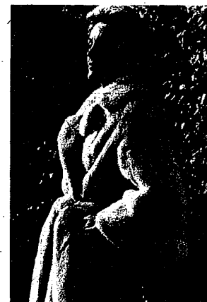
Canada Majestic Pearl Mink as illustrated at $3500.

DUTY & SALES TAX INCLUDED CURRENT EXCHANGE 11%