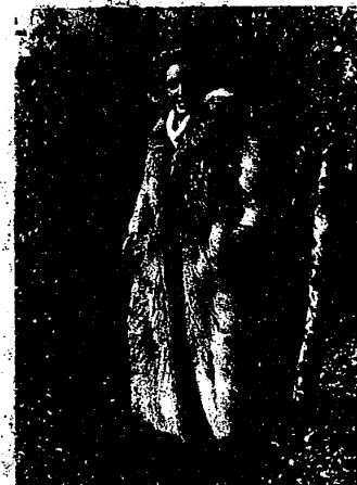
Canadian Lynx at its best.

DUTY & SALES TAX INCLUDED CURRENT EXCHANGE 11%