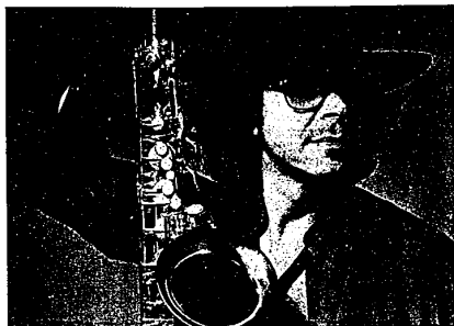
Gato Barbieri appears with Phoebe Snow.

Beginning June 9, tickets may be purchased in person at the Meadow Brook Box Office or at any Hudson's, Sears, Montgomery Wards or Grinnell's ticket services. For additional information, call the Festival Box Office at 377-2010.