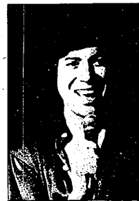
Bobby Goldsboro warbles Sept. 2.