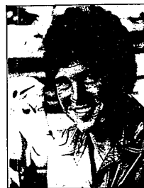
Bobby Vinton sings June 28.