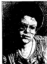
Phoebe Snow is heard July 18.